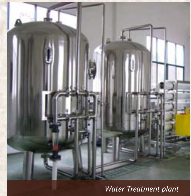
Water Treatment plant