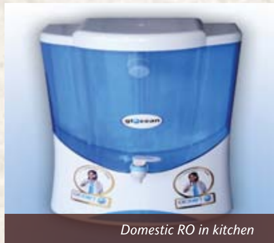
Domestic RO in kitchen