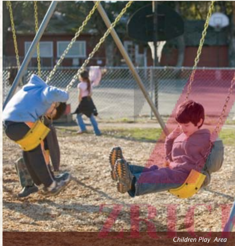
Children Play Area