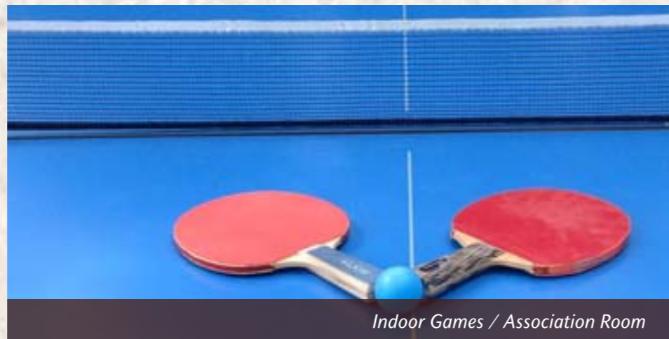
Indoor Games / Association Room